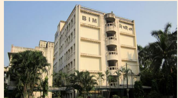
Main Campus: Sobhanbag, Dhaka