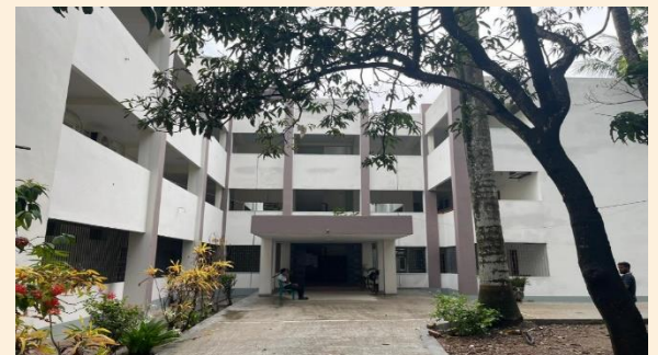
Divisional Campus–2: Boyra, Khulna