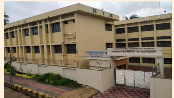
Divisional Campus – 1: Bhaddarhat, Chottogram